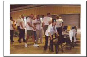
The Green Team placed third in spite of their protests.