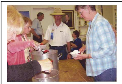
Strawberry night at the rally