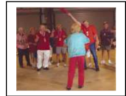
The Red Team's cheer helped them earn second place.