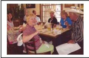
Favorite eaterie in St. Augustine The Columbia Restaurant