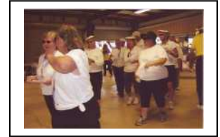
The White Team parades before the Olympic Games. They took first place.