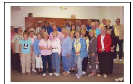
The Pink, Yellow and Blue Teams, all winners who did not place.