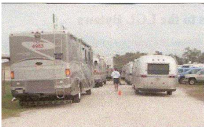
Waiting in line for the FL Unit to exercise its expertize in dump duty

A picture display on a vintage Airstream. Peaking into a vintage trailer. The entrance to Dutch Heritage, an Amish restaurant.