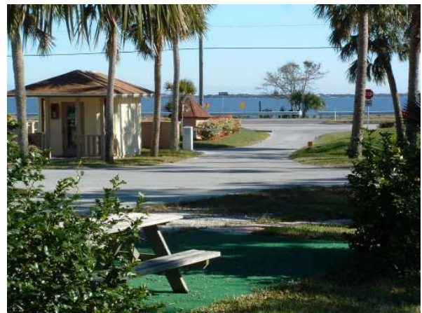
Camelot RV Park on the Indian River

Others besides our Unit may attend this rally so you want to get your registration in early. There is room for only 27 units, so don't be left out.