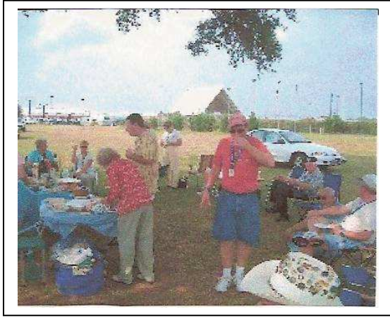
Florida Unit members enjoying Happy Hour at the International.