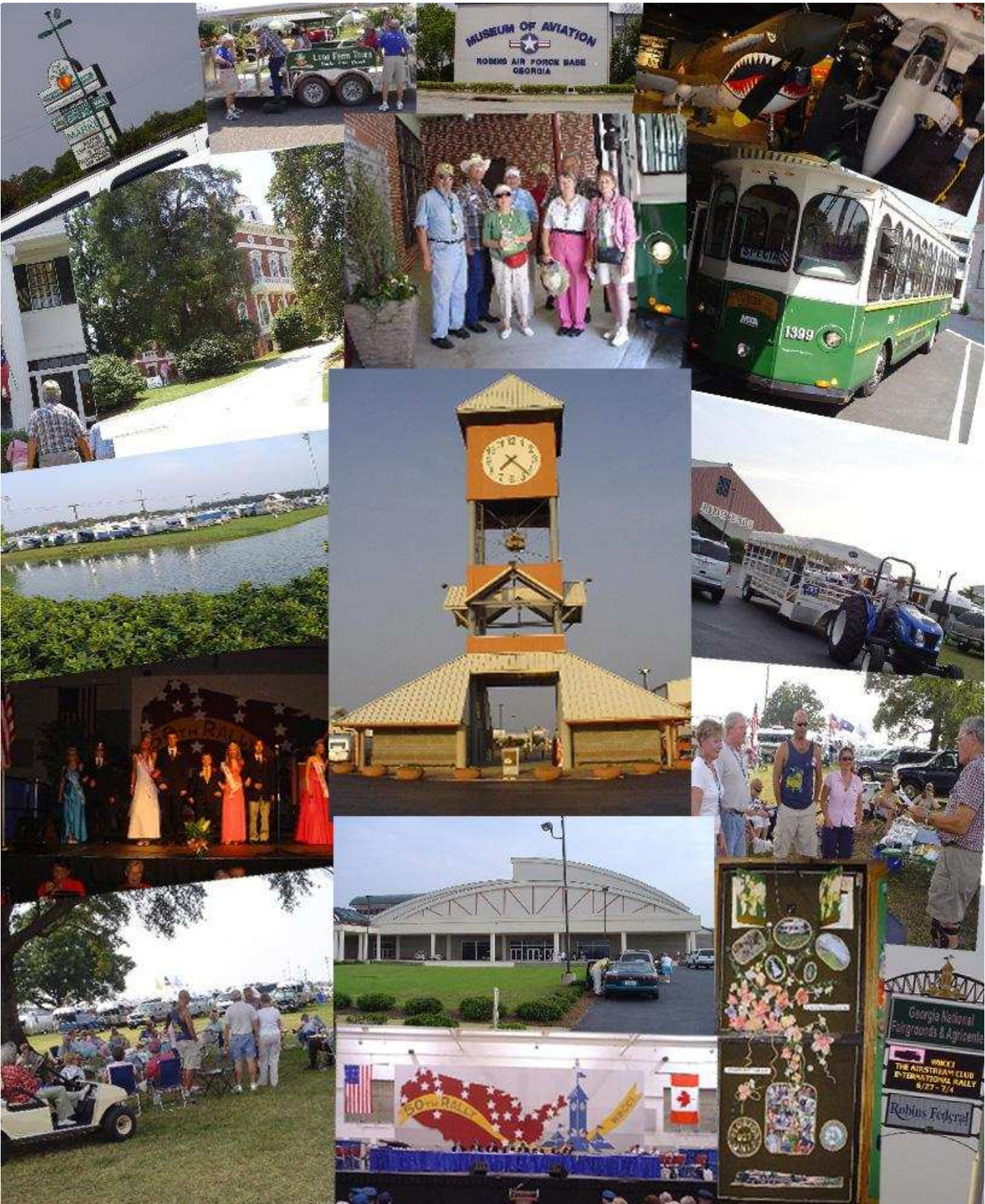
Collage by Vic Smith