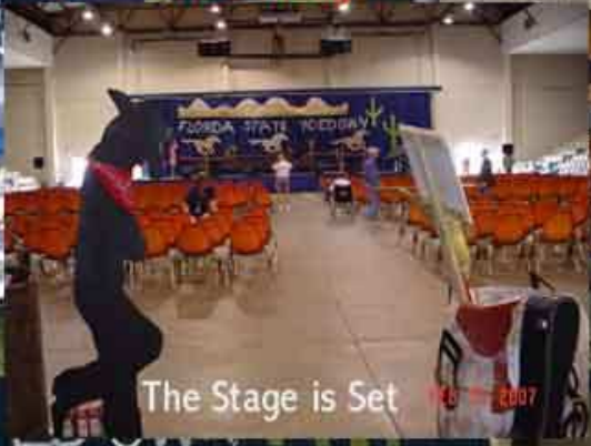
The Stage is Set