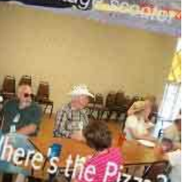
Where's the Pizza?