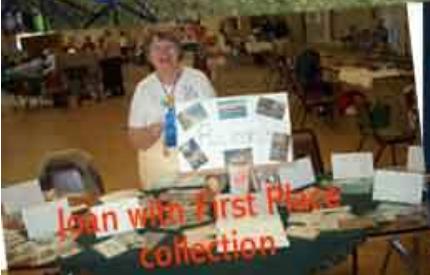
Loan with First Place Collection