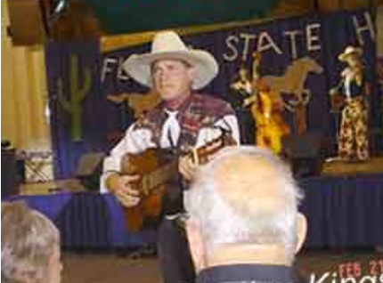
Rodeo Rhythm Kings