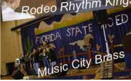
Music City Brass