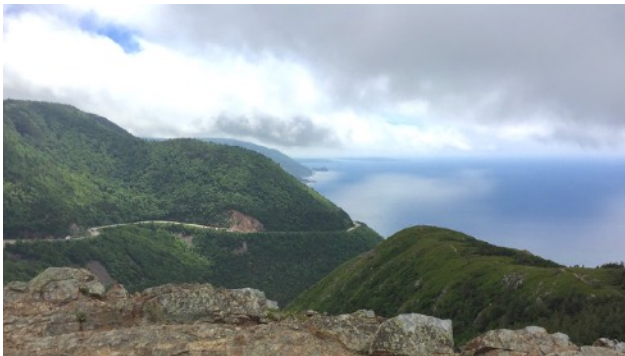
Cape Breton Highlands

From there I took the ferry to Nova Scotia, then up to Cape Breton and the breathtaking Cabot Trail drive around the headlands. Stayed in