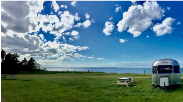
Cabot Beach Provincial Park, PEI

Then on to Prince Edward Island. Loved it! Drove the entire coastline north, south and west. The drive had a different view at every turn. The fishing villages were colorful. Lighthouses abounded. Harbors were spectacular, and camping well... look! And the seafood was plentiful and tasty.