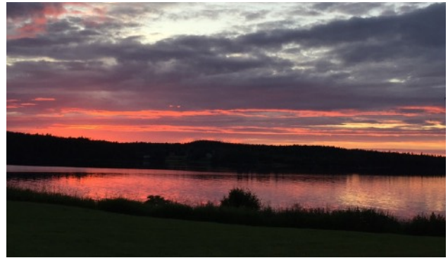
Sunset Point Campground

Now it was time to head back into the good ol' USA in time for 4th of July. Got to Lubec, Maine