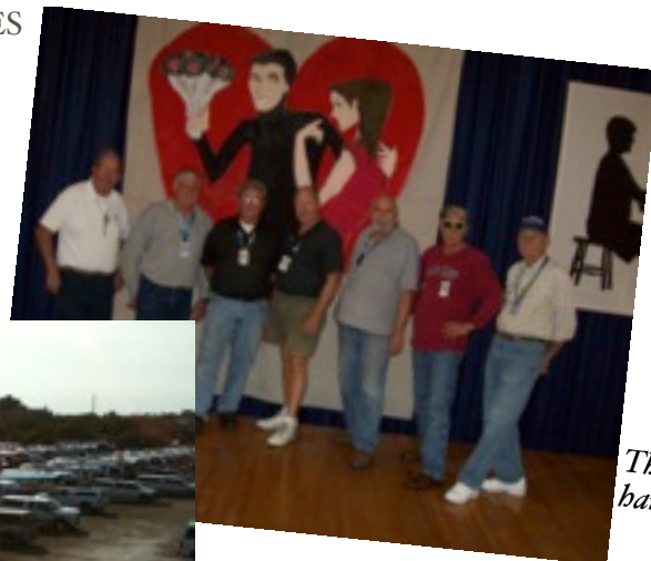
The backdrop hanging crew