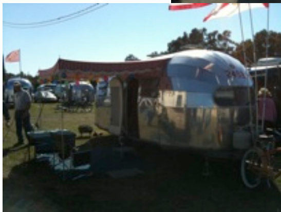
Tom's trailer in the vintage area